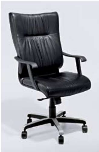
1200-300 (High Back)