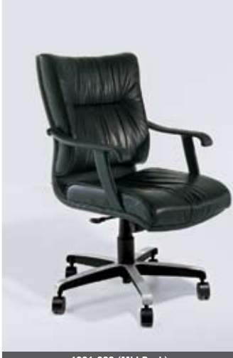
1201-300 (Mid Back)